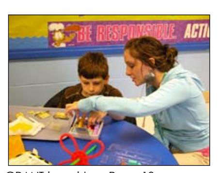
GRANT-ing wishes, Page 10