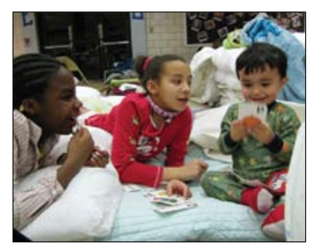
Shelter games, Page 12

School boards across the state will soon be asked to approve joining a state energy efficiency initiative. The move to save energy and money was mandated by the state's General Assembly and the deadline to join is approaching ... Page 16