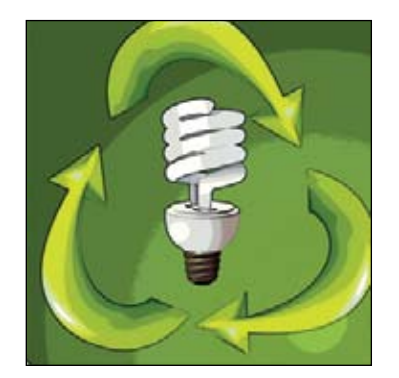
KEEP saving energy, Page 16